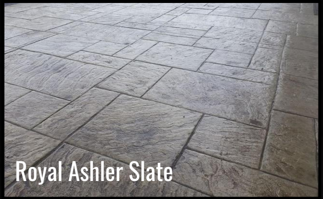
Royal Ashler Slate