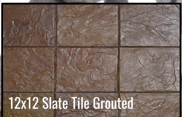
12x12 Slate Tile Grouted