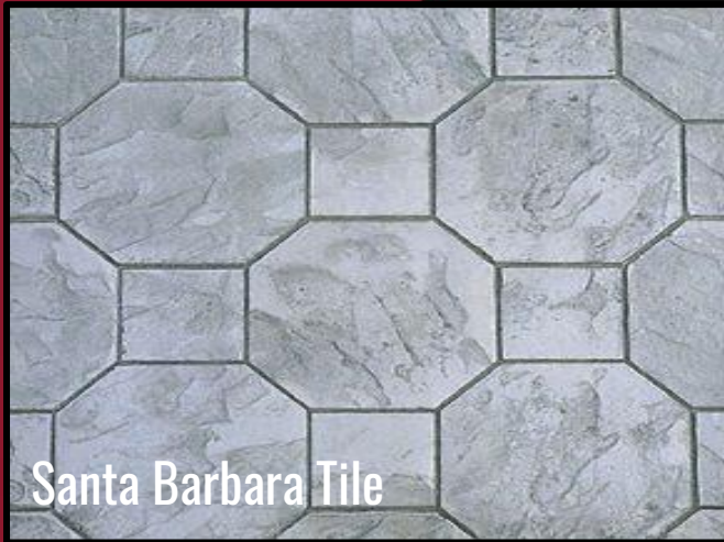
Santa Barbara Tile