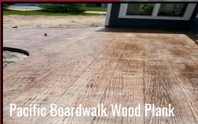
Pacific Boardwalk Wood Plank