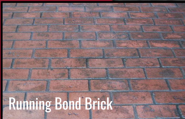
Running Bond Brick