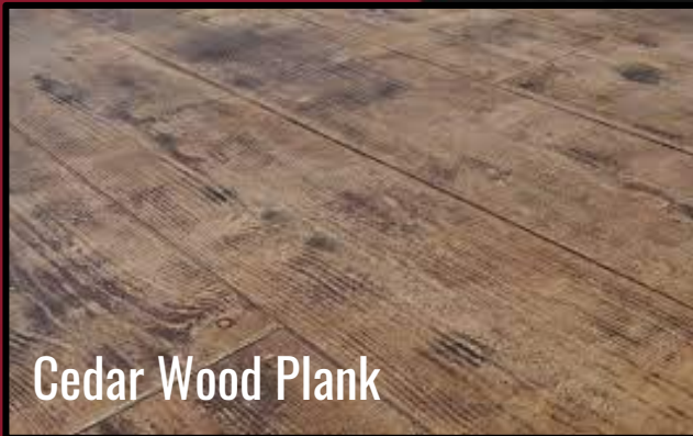
Cedar Wood Plank