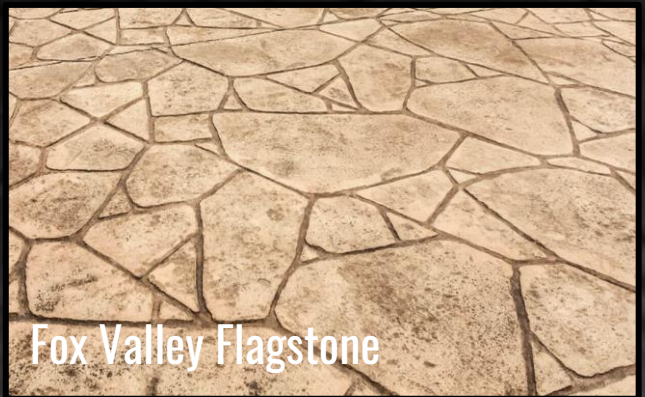
Fox Valley Flagstone