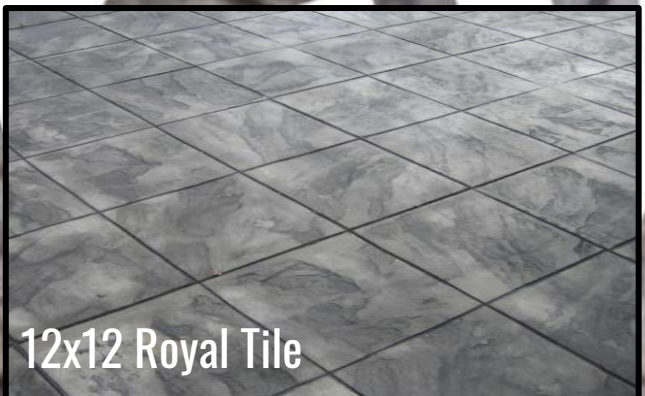
12x12 Royal Tile