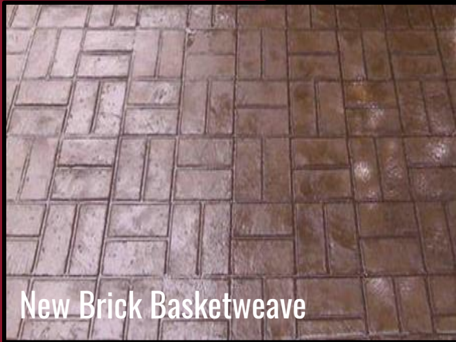
New Brick Basketweave