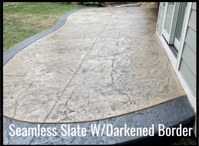
Seamless Slate W/Darkened Border

The G.I. Concrete team works with driveways, sidewalks, garage slabs, basements, stoops & steps, and patios, offering a wide array of exposed aggregate, stamping, and color for customers to choose from.