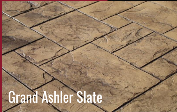
Grand Ashler Slate