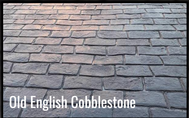
Old English Cobblestone