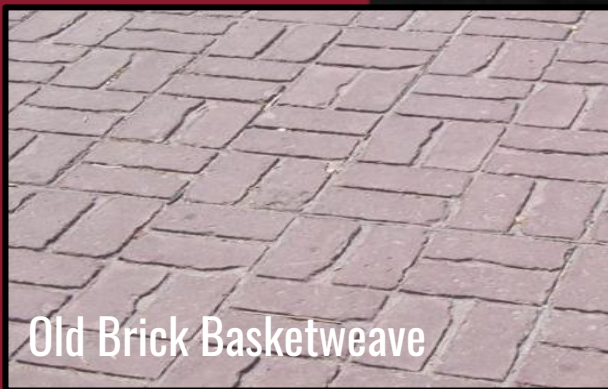
Old Brick Basketweave